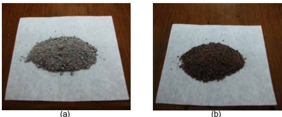
Figure 1. (a) non fermented cocoa, (b) fermented cocoa

The macroscopic test results showed that the fermented cocoa was more darker, and fragrant, while the non fermented cocoa beans pale and less smelly. The different colour between fermented cocoa extract and non fermented cocoa extract can be seen in figure 1.